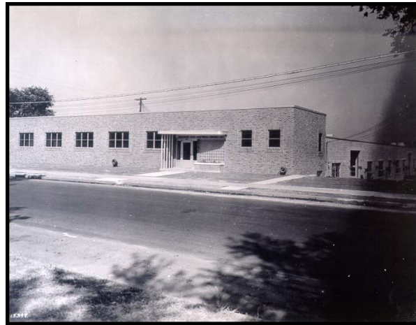
Picture before the 1964-65 office addition.

Due to growth, Standard Iron moved in 1945 to a new building along 2nd Street North between 27th and 30th Avenue North. The top floor housed a large drafting room and office. The manufacturing area was 100 x 200 feet located directly behind the office.